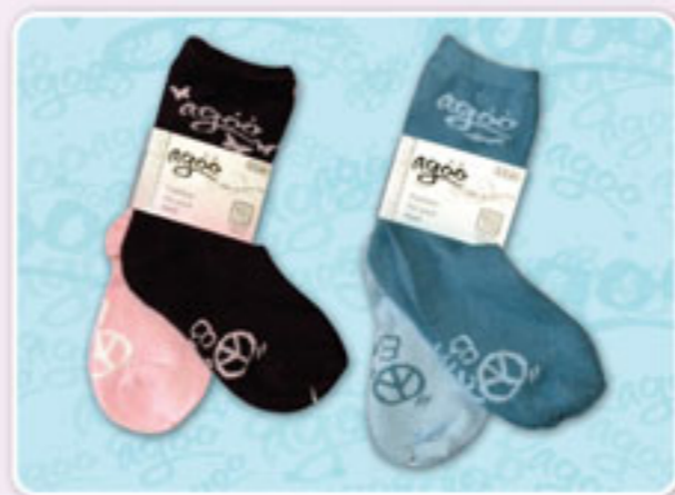
Agoo Bamboo Socks