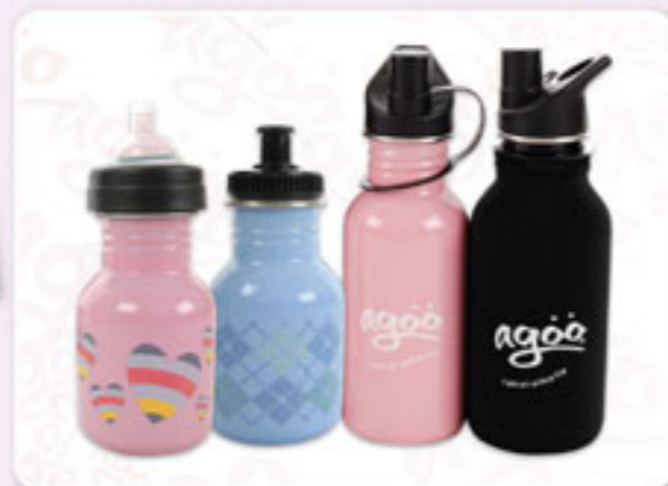
Agoo Stainless Steel Drink Bottles