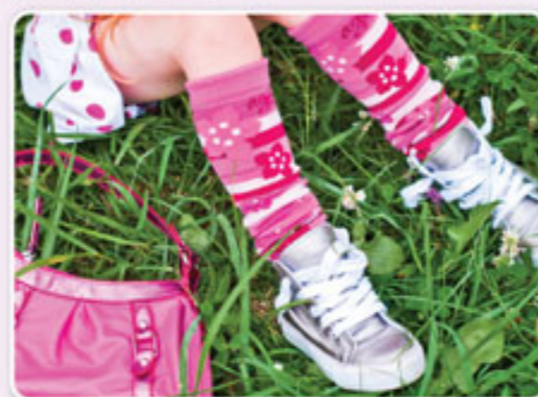
Agoo Bamboo Leggings