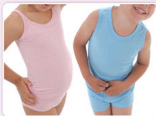
Agoo Bamboo Underwear/Sleepwear